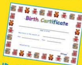
...AND COMPLETE THE CERTIFICATE!

THAT'S ALL IT TAKES! • NO SEWING! • NO STUFFING MACHINES!