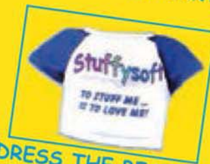
DRESS THE BEAR....