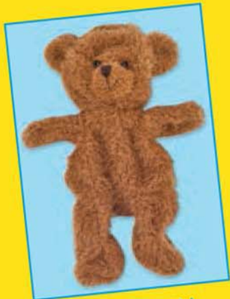
TAKE THE SKIN....