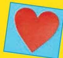
INSERT THE HEART....