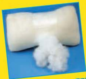
ADD THE FIBER FILL....